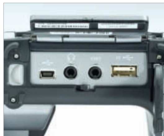
From Left to right: USB mini for PC image download, 4 pole audio for voice annotation, NTSC video, USB-A for memory stick image transfer