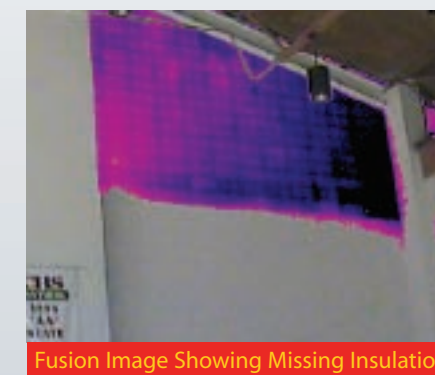
Fusion Image Showing Missing Insulation